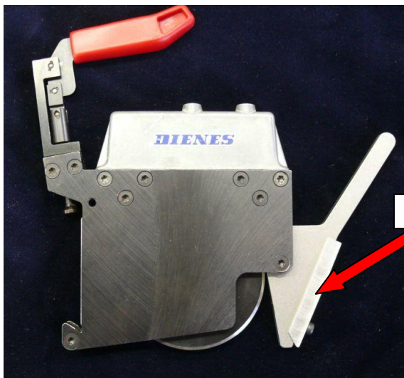
1. Swivel-mounted for knife exchange

We will be pleased to retrofit your existing knife holders with this quick- and safety change device.