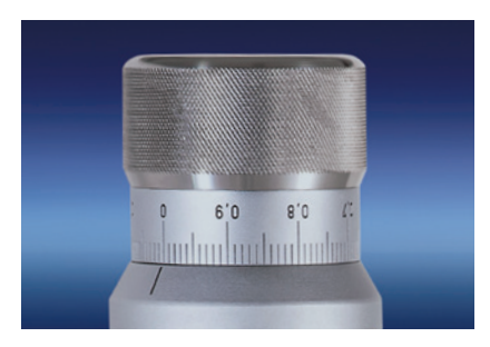
The lifting ring depth adjustment of the DS 8 knife holder

The innovative pneumatic shear cut knife holder DS 8 is the product of 100 years experience and innovative thinking at DIENES. The all-rounder impresses with very high stability and service life, a cutting width from 100 mm and speed of up to 3,000 m/min. It is usable in both directions and thus ensures maximum flexibility. With its highly precise and comfortable depth adjustment as well as sophisticated knife head setting, it also proves its worth when used with very thick foil and types of paper as well as other materials.