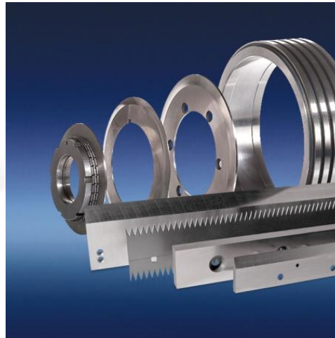
Highest precision: DIENES Straight – and Circular knives