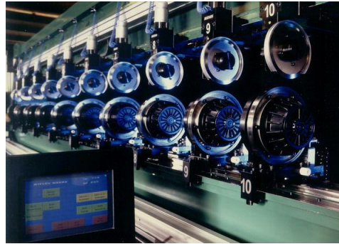
Fully automatic: Robot slitting system